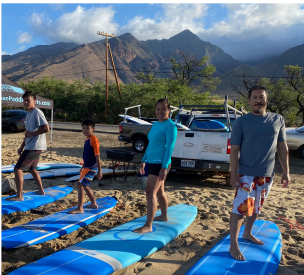
Local Maui family participating in the "100 Free Surf Lessons" program during the COVID-19 pandemic

In 2020, our efforts resulted in nearly $30,000 of total community impact, including volunteer hours, free community surf lessons, and the inaugural Ocean Steward Camp for Maui youth.