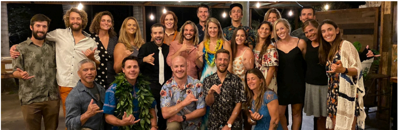
Hawaiian Paddle Sports team members celebrate at the 10th Anniversary Celebration