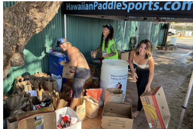
HPS team members sort food donations at the Paddle For Hunger 2021 event

Paddle For Hunger is one of the largest fundraisers for Maui Food Bank. Over the past five years, the event has raised $36,320 for Maui Food Bank and providing 158,488 meals for needy families in Maui County.