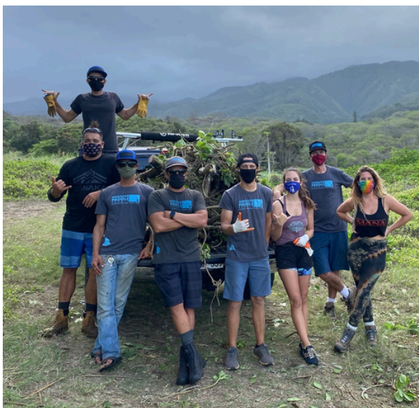
Hawaiian Paddle Sports team members working with Hawaiian Islands Land Trust to clear area for loko'ia, a traditional Hawaiian fishpond.

In 2021, our efforts resulted in $16,178 of total community impact, including volunteer hours, supporting 1% of the Planet partners, and our annual Paddle For Hunger event.