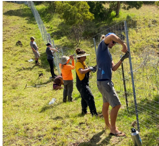
HPS Guides volunteer with Skyline Conservation to install and repair fencing to keep out invasive ungulates.

In 2021, Hawaiian Paddle Sport's Mālama Maui program donated nearly $5,000 in both direct and in-kind donations, including 134 community service hours.