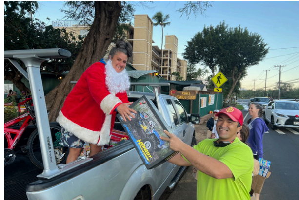
HPS members sort donated gifts at the 6th annual Paddle for Keiki event held in Kihei