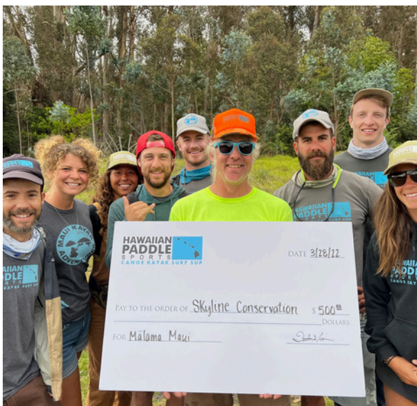
Hawaiian Paddle Sports team members present a $500 check to Mālama Maui partner Skyline Conservation and their native reforestation program.

In 2022, our efforts resulted in $45,556 of total community impact, including volunteer hours, supporting 1% of the Planet partners, and our annual Paddle For Hunger event.