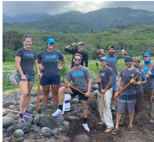
HPS Guides help restore a traditional rock wall for an inland fish pond at Waihe'e Coastal Preserve with Hawaiian Islands Land Trust.

In 2022, Hawaiian Paddle Sport's Mālama Maui program donated $13,599 in both direct and in-kind donations, including 283 community service hours and over $11,000 from fundraising events.