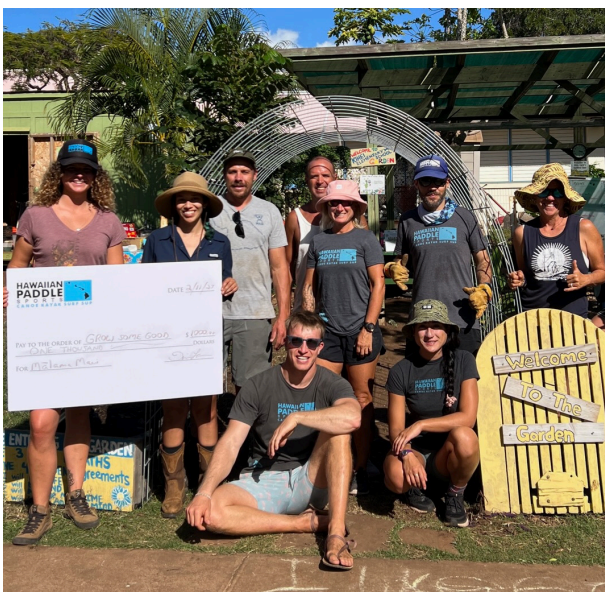
Hawaiian Paddle Sports team members present local food security nonprofit Grow Some Good with a $1,000 check and volunteer hours.

In 2023, our efforts resulted in $34,341 of total community impact, including volunteer hours, supporting 1% of the Planet partners, wildfire relief efforts, and our annual Paddle For Hunger and paddle for keiki events.