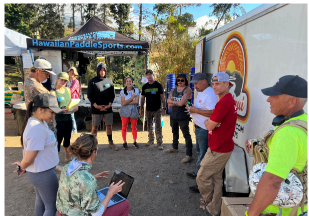
HPS staff and community members at the Kula Hub immediately after the fires.

Rebuilding our community after these tragedies will take ongoing and unified efforts across the island. We remain committed to supporting relief efforts across Maui and ensuring the resiliency of our island home.