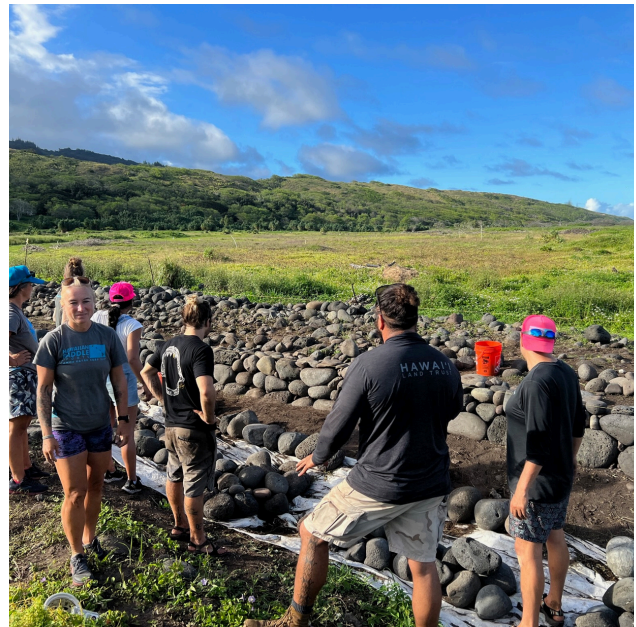
HPS team members help rebuild a traditional rock wall with Hawaiian Islands Land Trust.