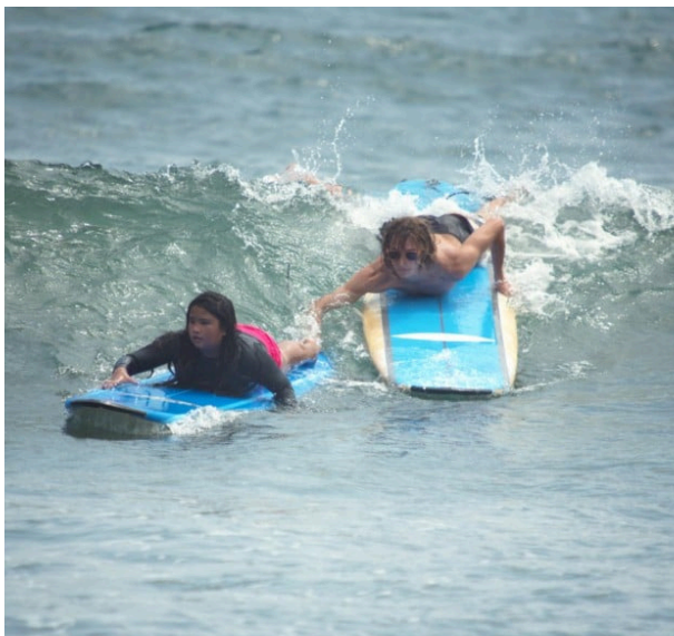
Hawaiian Paddle Sports team member pushes a local youth with Maui Youth and Family Services into a wave during annual Ocean Day with its Project Ventures Program.

Setting annual goals allows us to better gauge our impact and identify new opportunities for community support. In 2023, we aimed to further build on the momentum of our 2022 giveback efforts with a goal to increase our total community impact by 30% and provide at least 350 volunteer hours.